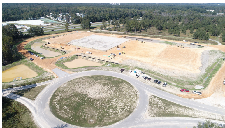
The 17-acre site in the Saxe Gotha Industrial Park where the spec building is under construction.

For more information on the Lexington County Speculative Building, please click here .