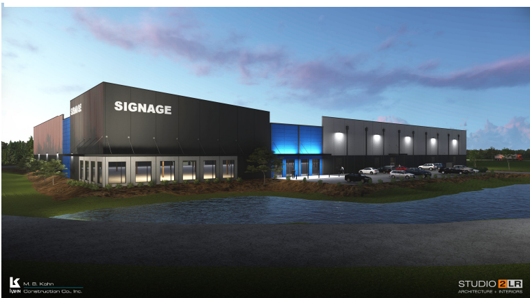
Rendering of the finished spec building.