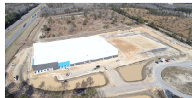
SGIP Speculative Bldg.

The County has procured four (4) drone videos, that introduce three (3) industrial parks and one (1) speculative building to investors and site selectors. You can watch them on YouTube by clicking the thumbnails below: