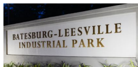
B-L Industrial Park