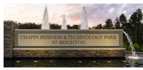
CB&T Park at Brighton