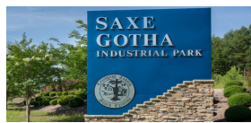
SGIP Industrial Park